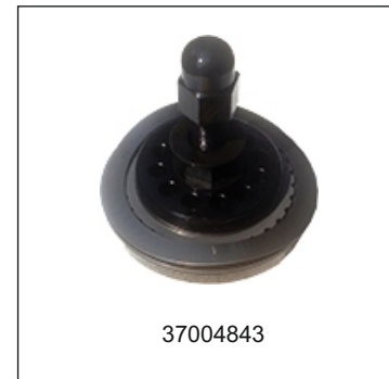
FIGURE 4. LOW PRESSURE CONCENTRIC RING VALVE